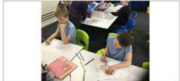
Year 3 really enjoyed creating book reviews based on Romeo and Juliet and sharing their opinions