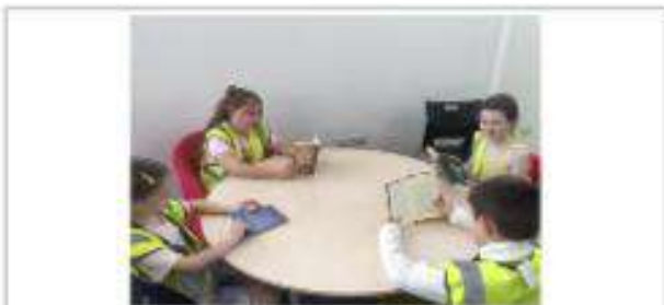
This week Year 4 went to the Hub library. We walked there and had the opportunity to read a variety of books