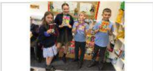
Year 5 have visited the library and looked at the new books on offer. We are excited with the new titles.