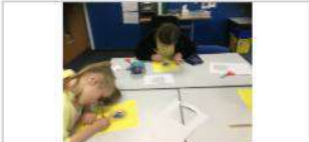
On Wish Bone Day we made informative posters to share information with people who might not know what it is about.