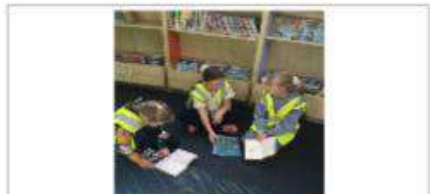
Some of us used our library cards to check out a book and others handed in application forms to receive new library cards