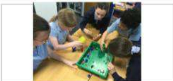
In Science, Year 6 have looked at Natural selection (survival of the fittest) and discussed how it can lead to adaptations and evolution within a species.