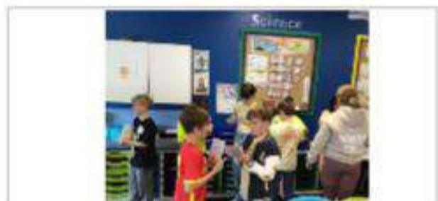
Year 5 have been testing each other on spellings this week by playing a game. We enjoying learning them and then testing different people.