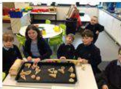
This week Year 5 had a little visit to reception. We helped the younger children with the Easter egg hunt and then helped them back to the classroom.