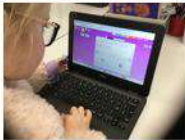
Year 3 created their own branching databases using all the skills they have developed over the half-term.