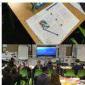
In English, Year 6 have been looking at Kensuke's Kingdom, making predictions about the text and working on our setting descriptions.