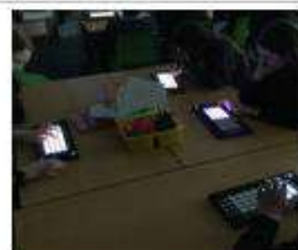
Year 6 have been DJs in music this term. We have worked to perform 'Blinded by the Lights' and loved hearing everyone play their parts.