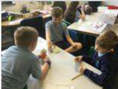
In Maths Mastery, Year 4 are continue to develop our multiplication facts and practising with our peers on quick fire questions.