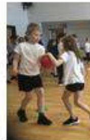
Year 3 really enjoyed playing team building games with Year 4 during PE. They all showed great sportsmanship and resilience!