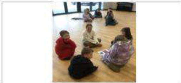
On Monday Year 4 for our World Book Day, we used our oracy skills to discuss the different books we studied in the morning.