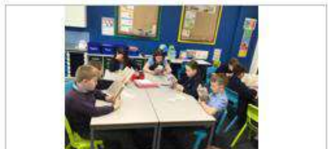
To continue Year 5's world book day celebrations we have been reading our new book called Bear Rescue. We are looking forward to finishing the book.