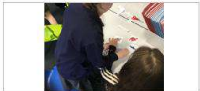
Year 3 began to use attributes to separate objects in our branching databases