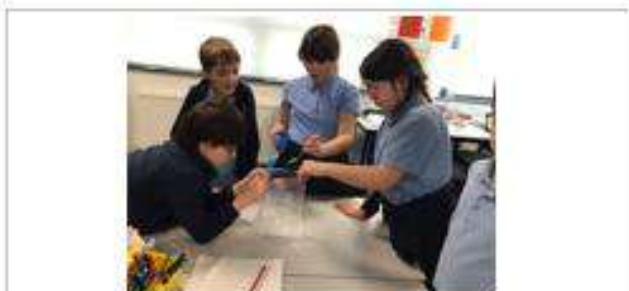
This week Year 5 have been making ice cream. We conducted an experiment to investigate reversible changes of state. We made some great predictions and had fun too.