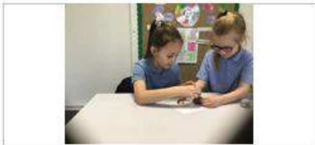
Year 3 discussed the fossilisation process using a story and we are eager to see if our fossils will have formed next week!