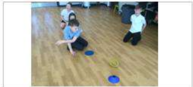
In PE, Year 4 we played Curling with no ice. Using the quoits, we slid them over the floor to try and hit the cones.