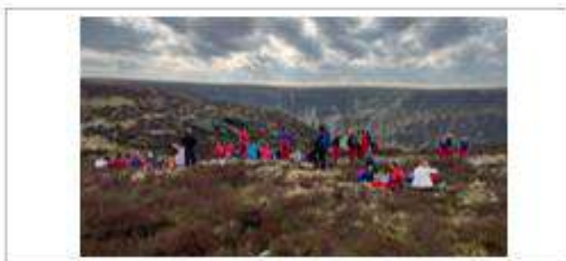
On Thursday, Year 6 went to Dovestones reservoir and completed the ghyll scramble. Everyone made it to the top and had a great day.