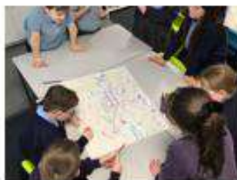
In DT, Year 5 received an exciting letter asking for our help to redesign the old library building in Hyde. We were shocked to see how the building looks & we started our brainstorming to improve it.