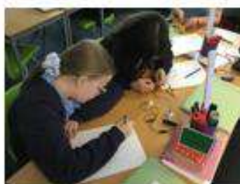
In Science, Year 6 have been having a look at how we can add variety to a circuit and what impact that will have on the components.