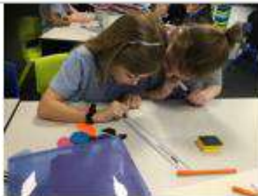
In Maths, Year 3 have explored how to measure perimeter and used string to help us measure curved edges.