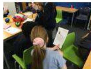
Year 6 found some letters we wrote in Year 2 this week! It was brilliant for the children to see how much they have progressed with their writing since then!