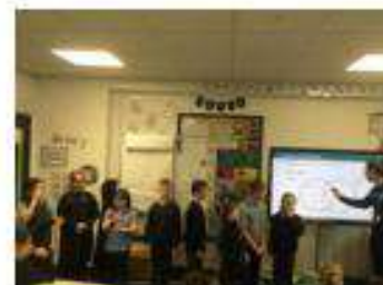
In Science, Year 4 began looking at grouping things using observable characteristics. We then used Venn and Carroll diagrams to represent the data.