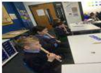
In Music, Year 4 have been using the recorders and reading music to help us play. We performed Biker Ben beautifully by the end of the lesson.