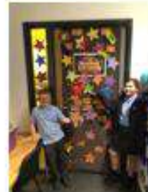
This week Year 5 started our new book 'The nowhere emporium.' We made our own door and used our senses and imagination to describe our feelings and actions.