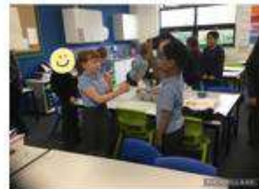
Year 3 explored the poem, Make it Green, this week in reading and decided on actions to help us remember the important messages it shared.