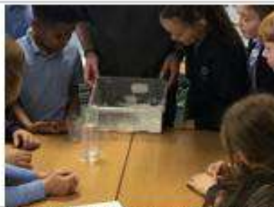
Year 3 had a fabulous Science Afternoon exploring different enquiries in the different classrooms. Everyone contributed their ideas and worked well with each other.