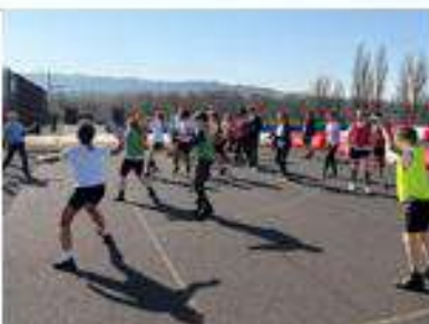
In PE, Year 6 played a brilliant game of bench ball with great teamwork and sportsmanship!