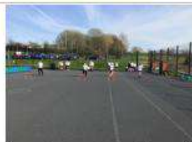
With the weather getting warmer Year 5 did PE outside. We played some team games and had time for a game of football at the end.