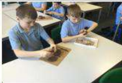
In DT, Year 4 used clay to make our modernised Greek perfume bottles.