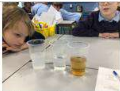
Year 5 enjoyed the science afternoon, we went to each classroom to complete a science investigation. In Year 5 we looked at reversible and irreversible changes.