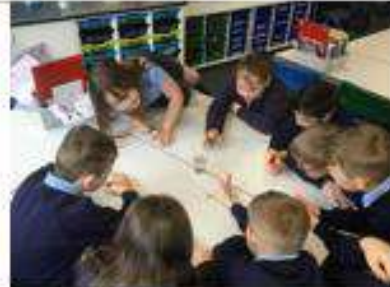
On Monday, Year 4 celebrated Science Day by completing different experiments in the different classrooms.