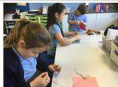
Year 3 have started their sewing in DT, they have been trying different stitches independently and applying the skill to their projects.