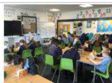
In Guided Reading, we have finally had chance to sit down with our World Book Day book and explore the amazing world of Skandar the Unicorn Rider.