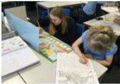
In Geography, Year 4 used atlases to find all the countries that make up the Mediterranean.