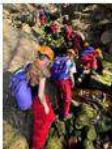
In English this week, we wrote up an activity review of our trip up the Ghyll Scramble !