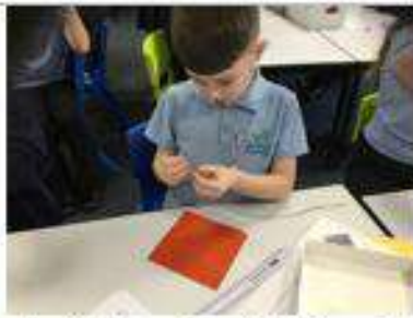
Year 3 developed their sewing skills this week by learning how to thread a needle and how to tie it to ensure a strong stitch could be formed.