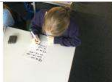
In Maths, Year 4 recapped the rule when finding a fraction of an amount. We have to divide the total by the denominator and then multiply the answer by the numerator.