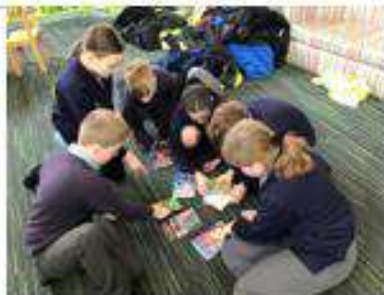
This week Year 5 have been for a walk around the local community. We have been looking at the developments of Hattersley and looking at building designs. We walked our way to the library.