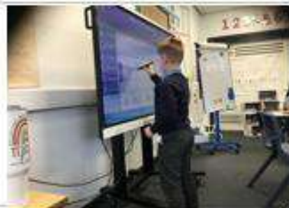
Year 3 have been focusing on improving our handwriting and love showing our new confidence to the whole class on the whiteboard.