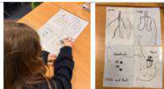
Year 6 have been learning all about the circulatory system and how our heart, lungs and blood keep us alive.