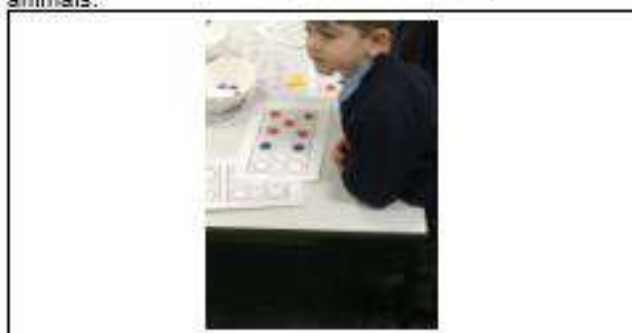
In Maths, Reception have been exploring composition of 6 and 7. We used Numicon, Die Frames and Ten Frames to show how we could make the numbers in different ways.