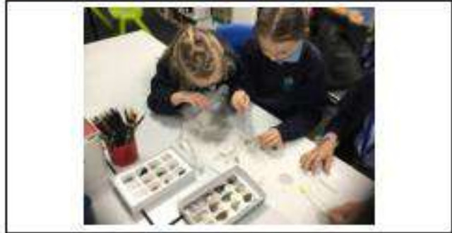
In Science, Year 3 tested the permeability of different rocks. We used pipettes to drop water on to the rocks so we could observe which ones were permeable and impermeable.