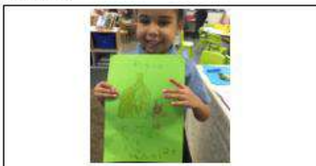
This week Reception have been writing sentences to retell the story of The Three Little Pigs. They have also been doing their own independent writing in Continuous Provision