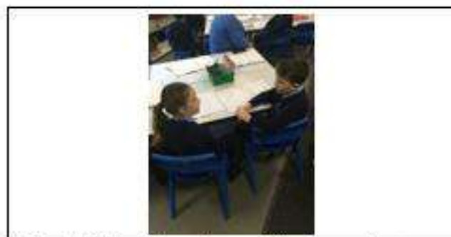
In English, Year 2 have been writing poems about themselves. The children gathered ideas about what makes them unique and used these to create thoughtful poems.