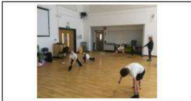
In PE, Year 4 pretended to act as different animals around the hall. We worked individually and in partners.