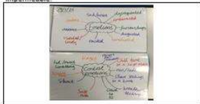
In PSHE, Year 4 discussed all about the different emotions and that we all have our own unique ways of showing these.