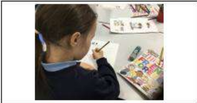
Year 3 have been exploring how templates are used to publish magazines and what editors need to consider to make them attractive to the audience.