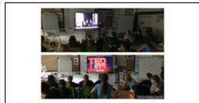
In English, Year 6 have had a look at how our practice skills can impact how we present a speech, using our very own poetry competition winner as an example.