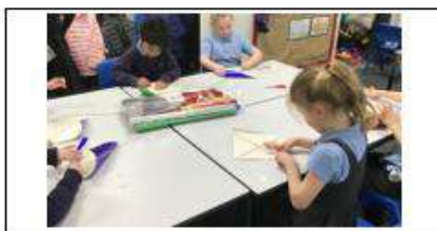
Year 1 started to make their kites in DT this week. They followed their designs and used tape and sticks to make sure they were strong enough for a gust of wind.