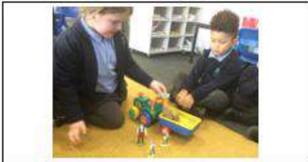
Nursery have been down on the farm this week in maths. We have been helping the farmer to load up his tractor with the animals. We compared different groups of animals.