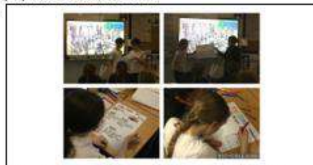
In History, Year 6 presented their research about The House of Wisdom in the ancient city of Baghdad. We discussed the reliability of sources from the time, and debated what is true and what may have been fabricated.