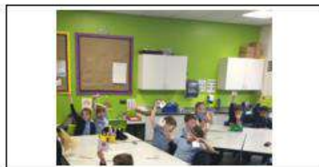
This week in PSHE, Year 2 explored what is fair and unfair. The children discussed different scenarios, voted, and used excellent oracy skills to debate their opinions.