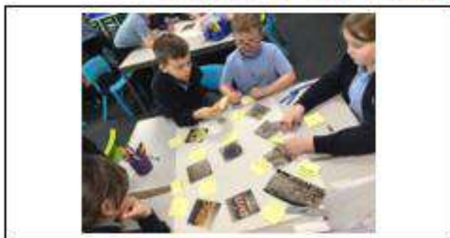
This week in Geography Year 5 have been looking at Viking and Anglo-Saxon artefacts. We then used the laptops to do further research.