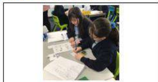
In Maths this week Year 5 have used the area model to multiply 2-digit numbers by 2-digit numbers. We found this tricky last week but now we are finding it easier.