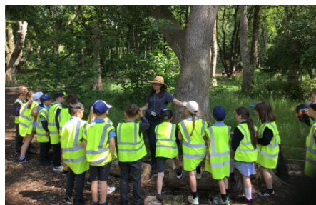
Year 3 had a fantastic trip to RHS Bridgewater and listened carefully to how plants function and grow.