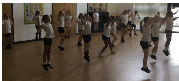
In dance this week, we enjoyed learning the Bart Simpson, Smurf, Top Rock and Stomp dance moves.