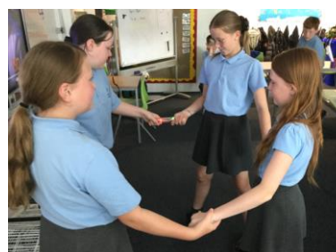
This week, Year 6 have been revisiting Electricity in Science. We have reviewed our knowledge on what circuits and circuit components are, and then looked at how to build one.