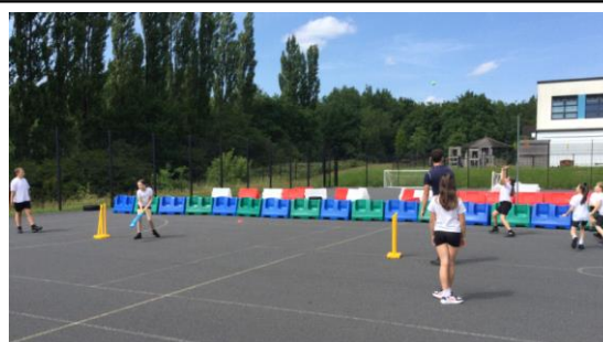
We have also been enjoying the British summer by learning and improving our cricket skills.