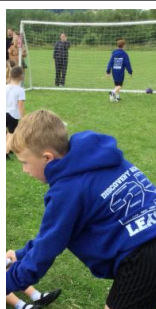
Year 6 also supported EYFS and KS1 with their sports day! It was brilliant to see how Year 6 supported the younger children, cheering them on, even with the heat beating down!