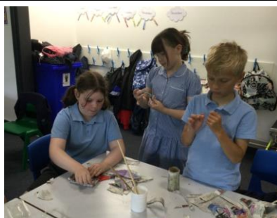
This week Year 4 have been completing some creative art work, using different materials to make food.