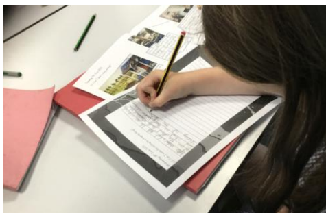
Year 3 have been working hard writing their own stories based on The Flood.